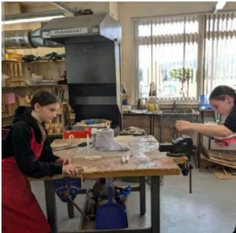
Pupils working hard in the new Tech Club

A big shoutout to Kilchuimen Academy's Technology students, who secured £5,886.46 for a residential trip to Copenhagen. This experience promises an enriching blend of educational and cultural activities that will align with their curriculum and broaden their horizons.