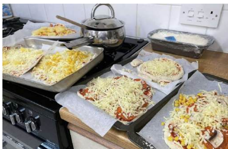
Homemade pizzas for lunch at Community Tuesdays

Community Tuesdays offer locals a warm, safe space to socialise and share a hot meal all thanks to the hard work of volunteers who are truly the heart of the community.