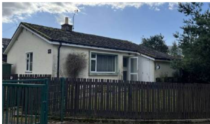
Janitors House on Station Road

To move forward, we need to demonstrate community interest and support for this affordable housing project.