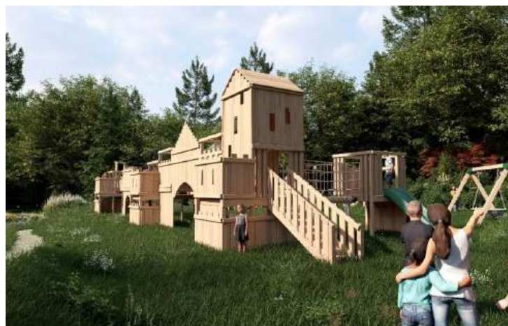
Proposed layout of the Convent Land play area

The design for the play area was shaped by the imagination and insights of Kilchuimen Primary pupils, who contributed ideas about what they'd love to see. Their suggestions have been integrated into the final design, which will feature: